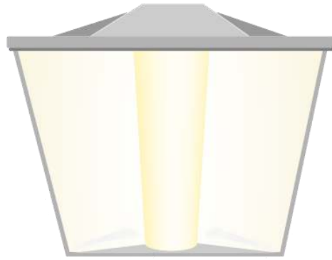
Figure 3: Isometric view of a troffer with a luminous basket and luminous panels on each side. The luminous shape would be represented by a rectangle or rectangle with luminous sides encompassing entire luminaire.