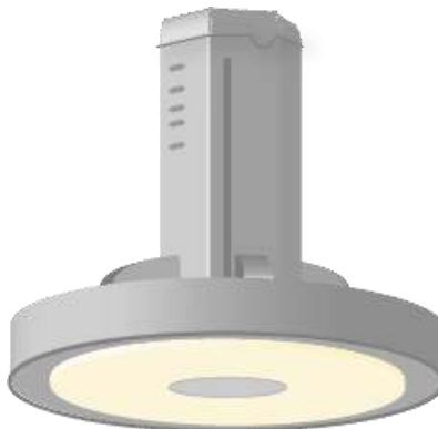
Figure 5: Isometric view of a high bay product with LEDs on the underside. The luminous shape would be represented by a 2D luminous circle, with length and width elements represented as negative values of the respective diameter (see LM-63 for details). If the luminous surfaces were on the sides as well, a vertical cylinder or rectangle with luminous sides would be used instead.