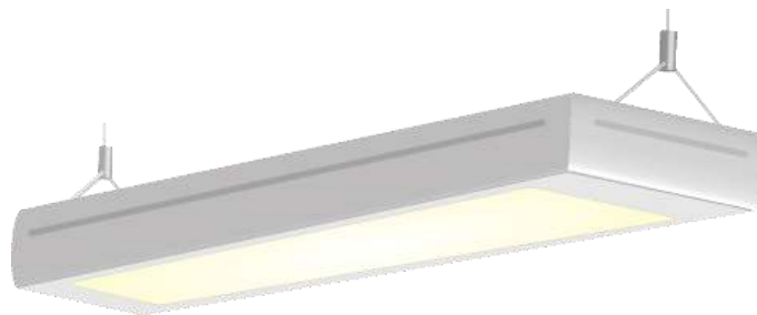
Figure 4: Isometric view of a linear ambient product with a luminous panel at the bottom. The luminous shape would be represented by a rectangle the size of the luminous panel only. If the sides were luminous, a rectangle with luminous sides would be used.