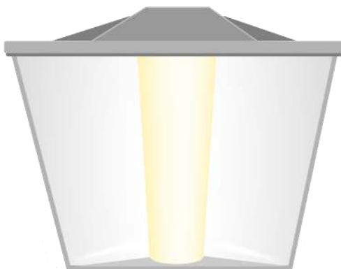
Figure 2: Isometric view of a troffer with luminous basket and non-luminous panels on each side. The luminous shape would have the width, length and height of the rectangle or rectangle with luminous sides encompassing entire luminaire.

For example, for a troffer with a luminous basket, the length, width and height of the entire luminaire must be represented as a rectangle with luminous sides or a rectangle, per Annex D in IES LM-63-02 (R2008). Figure 2 through Figure 5 show examples of luminous shapes for luminaires in each General Application.