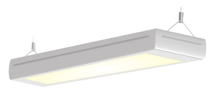
Figure 4: Isometric view of a linear ambient product with a luminous panel at the bottom. The luminous shape would be represented by a 2D rectangle the size of the luminous panel only. If the sides were luminous, a rectangle with luminous sides would be used.