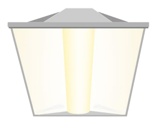
Figure 3: Isometric view of a troffer with a luminous basket and luminous panels on each side. The luminous shape would be represented by a 2D luminous rectangle because a complex shape is not permissible in LM-63.