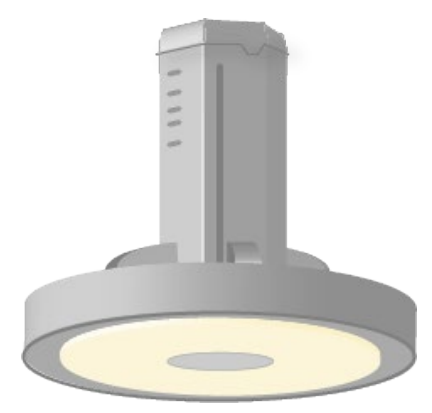
Figure 5: Isometric view of a high bay product with LEDs on the underside. The luminous shape would be represented by a 2D luminous circle, with length and width elements represented as negative values of the respective diameter (see LM-63 for details). If the luminous surfaces were on the sides as well, a vertical cylinder or rectangle with luminous sides would be used instead.