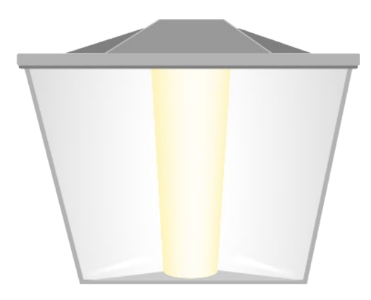
Figure 2: Isometric view of a troffer with luminous basket and non-luminous panels on each side. The luminous shape would have the width, length and height of the basket only.

For example, for a troffer with a luminous basket, the length, width and height of the basket must be represented as a rectangle with luminous sides or a horizontal cylinder, per Annex D in IES LM-63-02 (R2008). Figure 2 through Figure 5 show examples of luminous shapes for luminaires in each General Application.