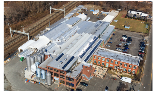
Two Roads Brewing Company located in Stratford, Connecticut modernized their lighting to capture energy savings and convenience.