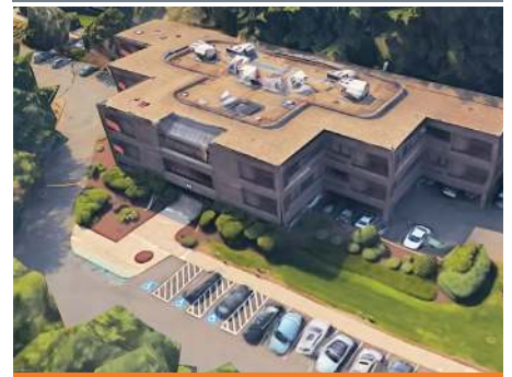
The building owner updated the building lighting for energy savings and improved lighting quality.